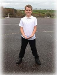
16 th November: Sebby & Boo