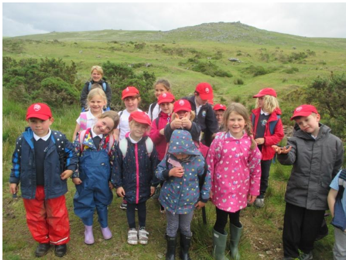
LITTLEMOOR ON DARTMOOR