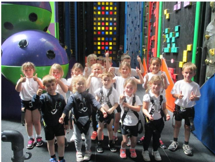
CLIP 'N' CLIMB EXETER