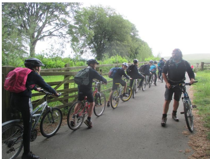
YEAR 6 CYCLE ON GRANITE WAY