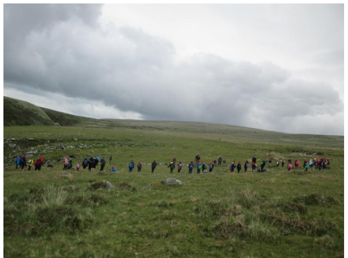
A HUMAN STONE CIRCLE DARTMOOR