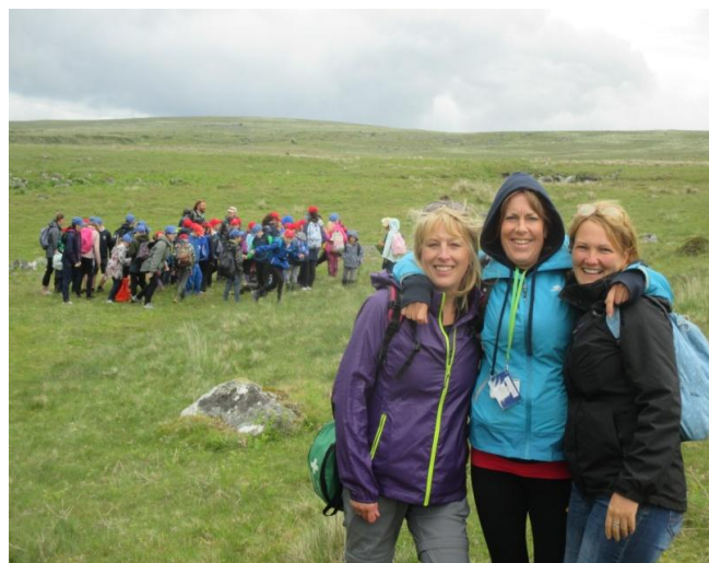
HAPPY STAFF, HAPPY CHILDREN